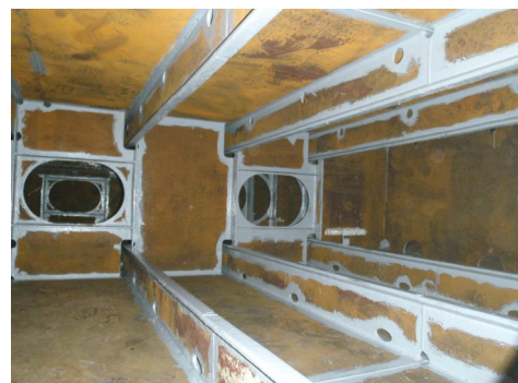
RS 500P stripe coat applied in a potable water tank