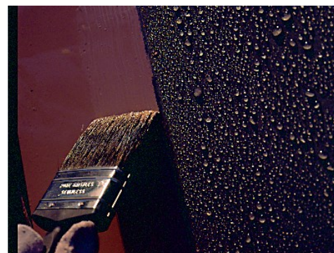
Applying RS 500P on a wet & sweating substrate