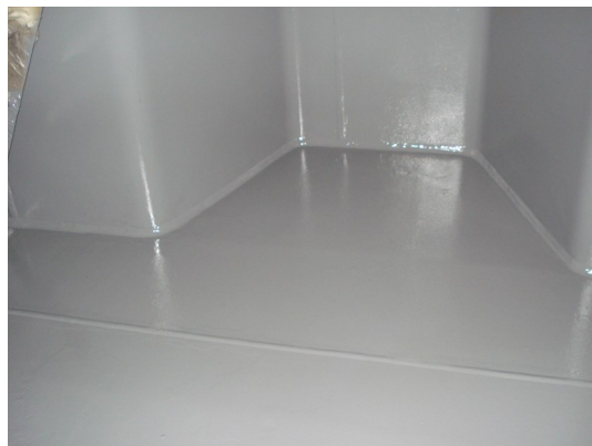
Epo-chem™ RW 500: Topcoat / Second Coat