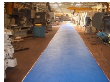
Fast-flor™ RS 800 Factory Floor