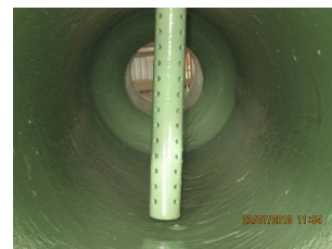
Hot-cote™ RD 900 Still Column Lining