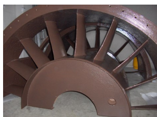
Hot-cote™ RF 900 Nuclear Power Station Fan